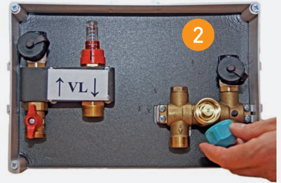
2 Fold open valve body forward and remove protective cap