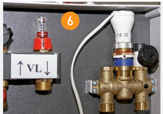
6 Fold back the valve body