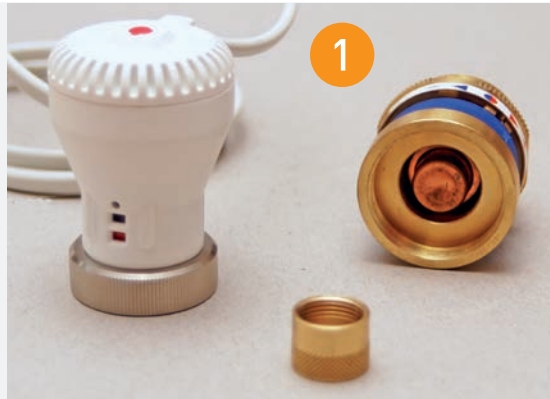
1 Assembly set, consisting of thermoelectric actuator, thermostat attachment (including expanding element sensor), brass sleeve