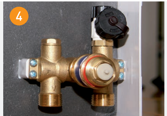
4 Unscrew the thermostat attachment (including expanding element sensor)